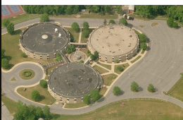
Lebanon Valley High School