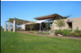
Penn State Arboretum